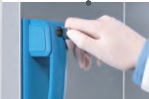
A lockable door provides restricted sample access