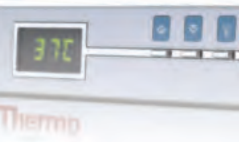
Easy to use interface

NOTE: All figures in all tables are typical average values for series devices, based on factory standard following norm Din12880. Please contact us for certification information or IQ/OQ documents.