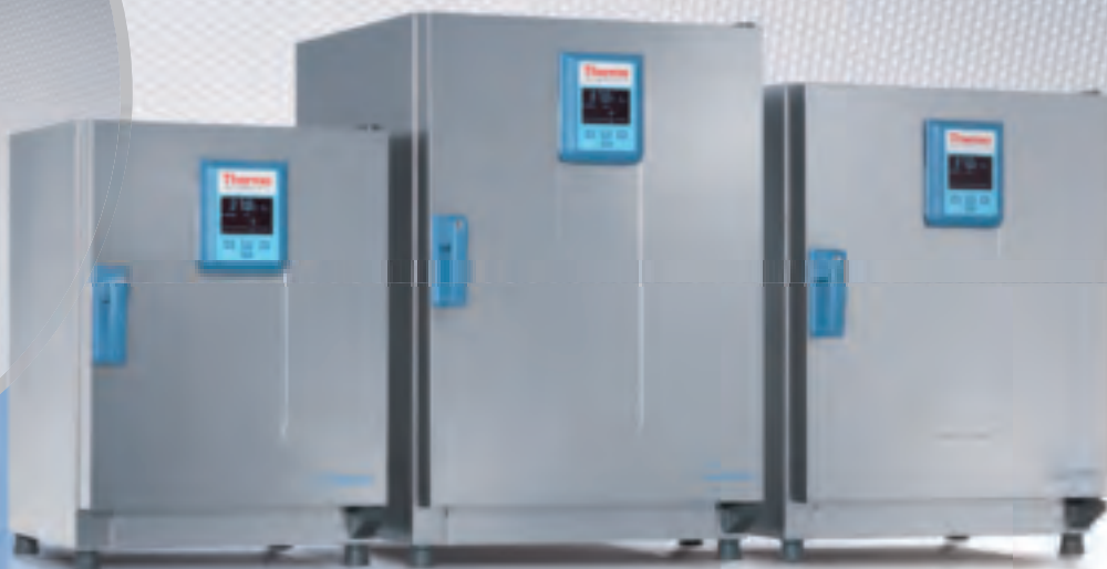
Heratherm Advanced Protocol Security microbiological incubators with sophisticated stainless steel exterior

• Check the unique optional sample sensor: