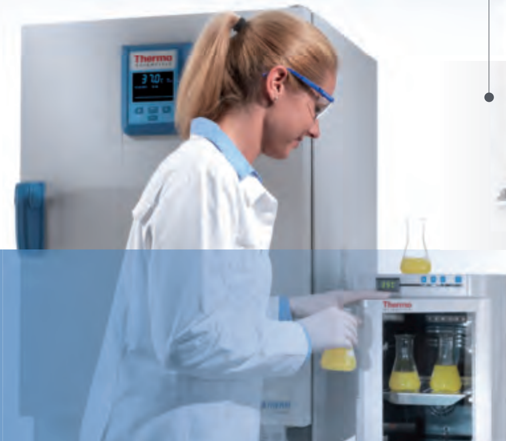
The perfect solution for personalized incubation