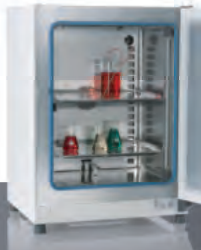
Heratherm Advanced Protocol Security microbiological incubator with unique dual convection and additional alarm systems

Building on our established CO 2 incubator decontamination technology, we are now presenting the first microbiological incubators with an independently certified 140 °C decontamination routine 1 .