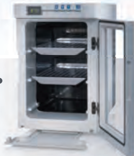
Heratherm Compact microbiological incubator, 18L

The most compact unit of the Heratherm microbiological incubators family has an 18L capacity, ideal for personalized workspace.