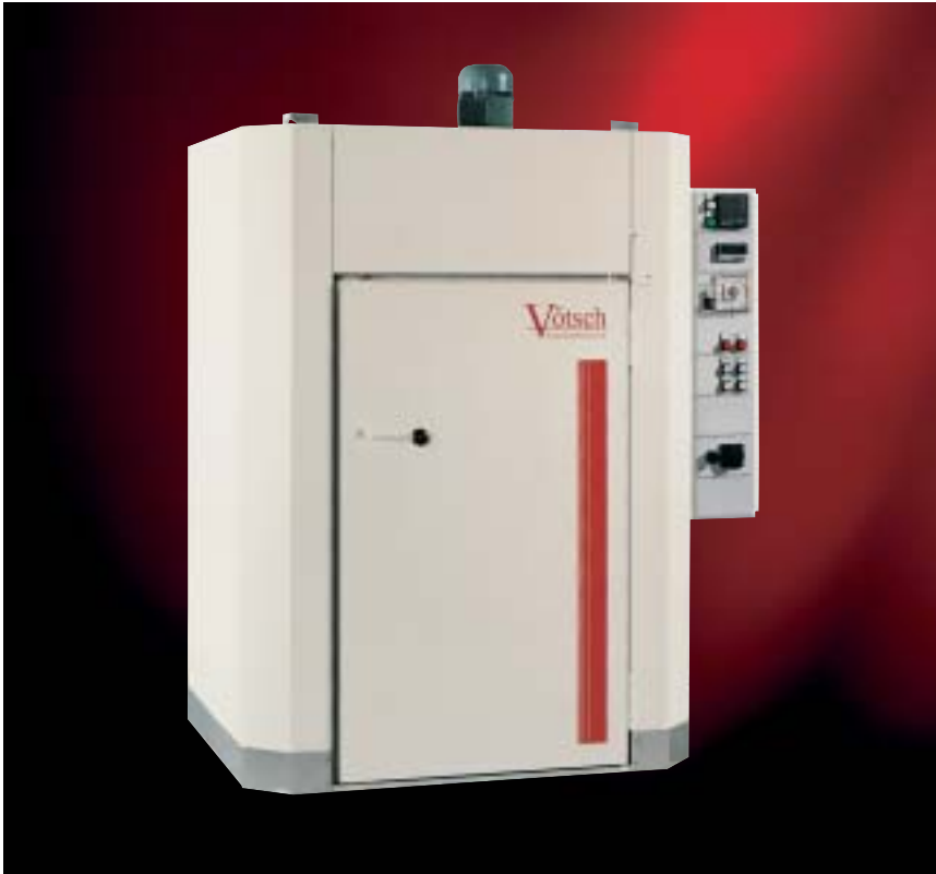
Heating and drying oven (VTU 75/100) system. These heating and drying ovens are suitable for all applications in process where no combustible solvents are released.