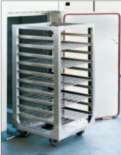
Charging trolley with shelves

For the preparation and insertion of complete charges in the working chamber and for transportation within the company.