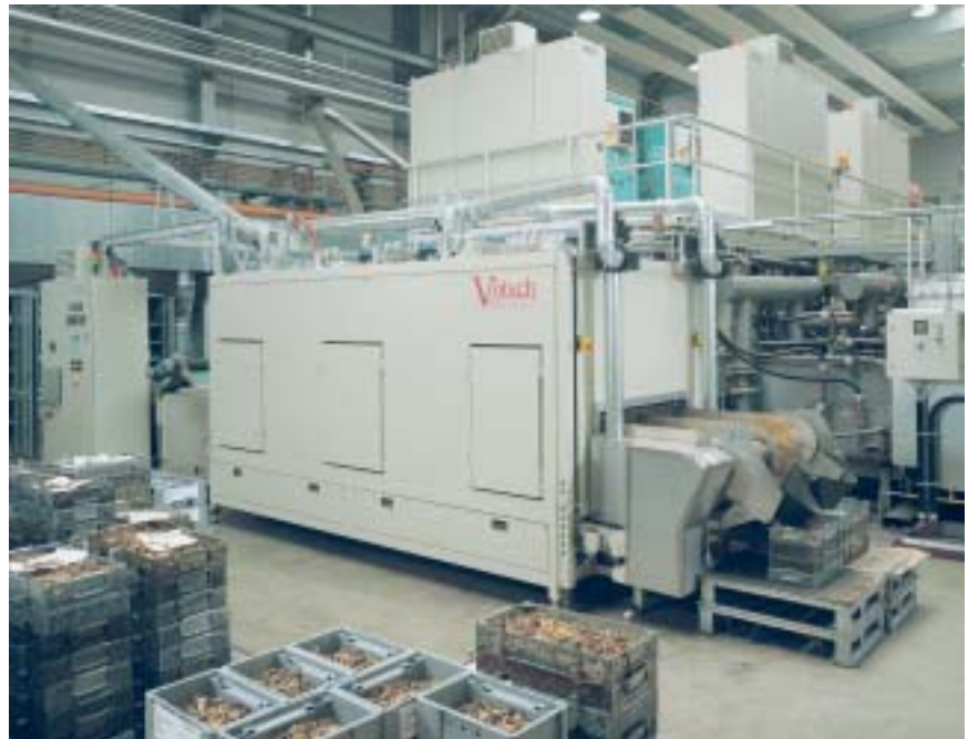
Continuous Oven Type VTUD 125/40/200 with cooling zone