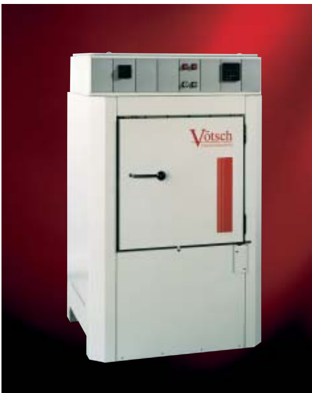
Heating and drying oven VTU 60/60.