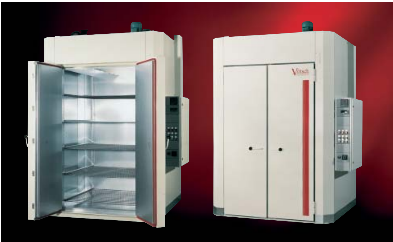
Chamber drying oven (VTL 125/200)